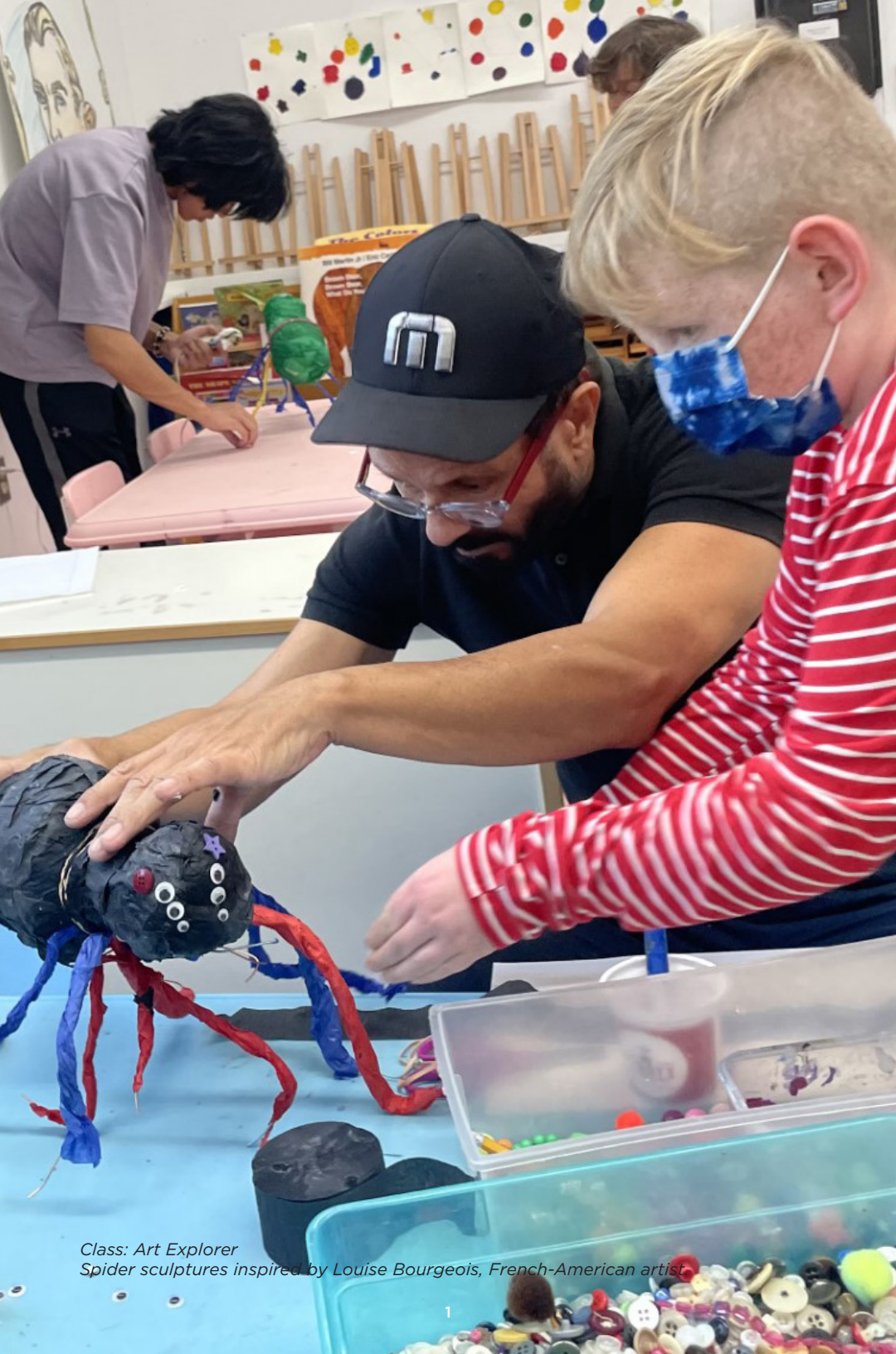
Class: Art Explorer Spider sculptures inspired by Louise Bourgeois, French-American artist.