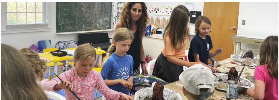
Class: Art ABC Volcano Dioramas

All supplies included with registration.