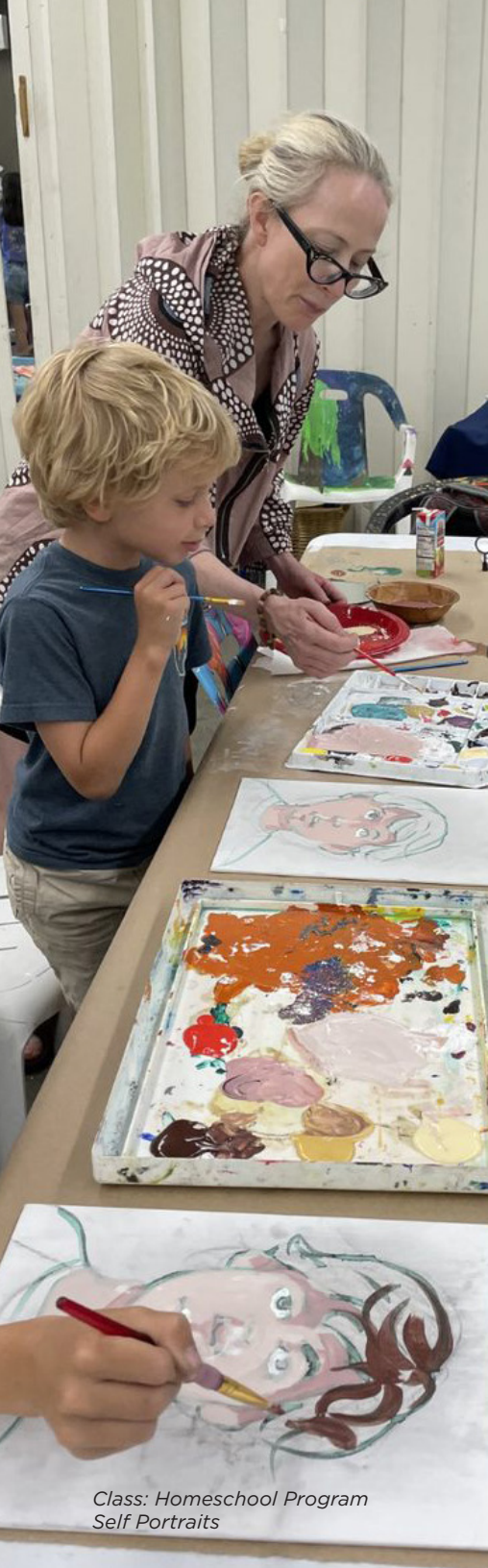
Class: Homeschool Program Self Portraits