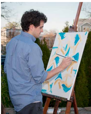
The popular summer series Art after Dark features live art.