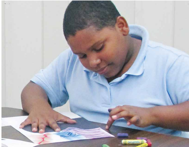
Art classes at MAC cultivate creativity in young learners.

Field Trips, discussing artworks in the galleries, making connections to their own experiences and creating original artwork in the studios. 870 participants were involved in our off-site presentation, Art in a Box. To help in the education of homeschooled children, we introduced our monthly Homeschool series.