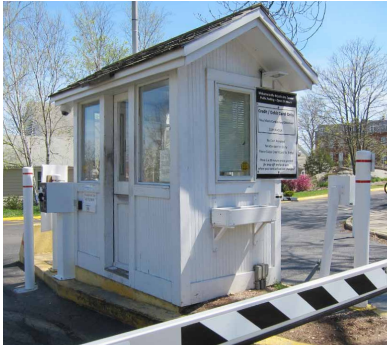
Mystic Arts Center updated its parking operations with an automatic system.

and modernization of our parking operations. While this proved to be exceptionally challenging for the Board and staff, as well as for many users of the facility, we believed that, with continued refinement, we would achieve a much more user-friendly operation that will yield significantly improved financial results for years to come.