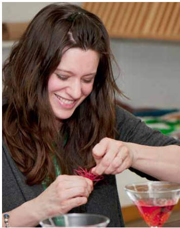
Mystic Arts Center offers a variety of adult programs, including the popular Artini Hour .

In all, 788 children and adults enrolled in studio art classes. Studio Art Education, our longest running program, saw improvements to the facility, changes in curriculum, and guest appearances from master-level teachers. For the first time in our curriculum, we were able to offer classes in print-making, the newest drawing craze “Zentangle,” and expressive art for healing. In the fall, we introduced a series targeting teens that assisted them with portfolio preparation, as well as a new toddler class, Art Start.