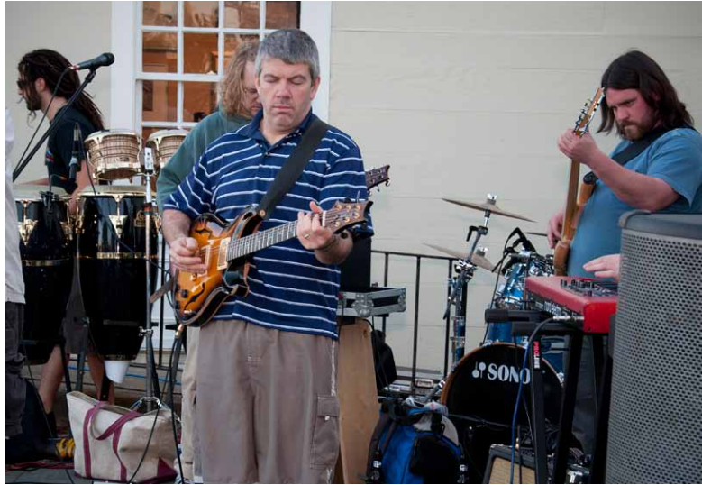
Art After Dark showcases live music performed on the MAC terrace.