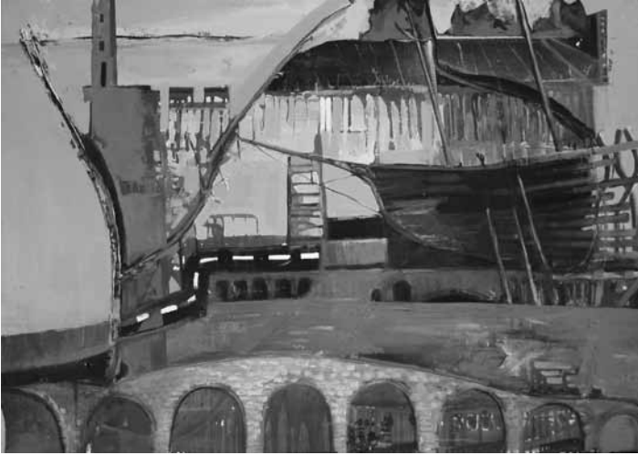
Venetian Ruin , Acrylic on canvas

“It was an honor to show at MAC. I had every confidence coming in and was very impressed with all the support. It seems Mystic Arts Center is in good hands.”