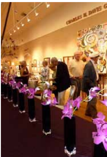
OffTheWall 2010 table decor by Gira!