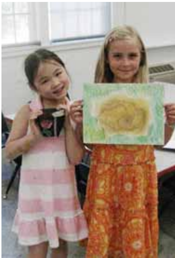
Afterschool ArtShop students display their finished art projects.

Magnet School; in Groton, Northeast Academy, Fitch Middle School, Fitch High School, Claude Chester; in Stonington, Dean's Mill, the YMCA, Denison Pequotsepos Nature Center Pre-school, West Vine Street School, and Stonington Free Library; and John B. Stanton Elementary, Wequonnoc Elementary School (Norwich), Gallup Hill School (Ledyard), Griswold High, and Old Lyme High.